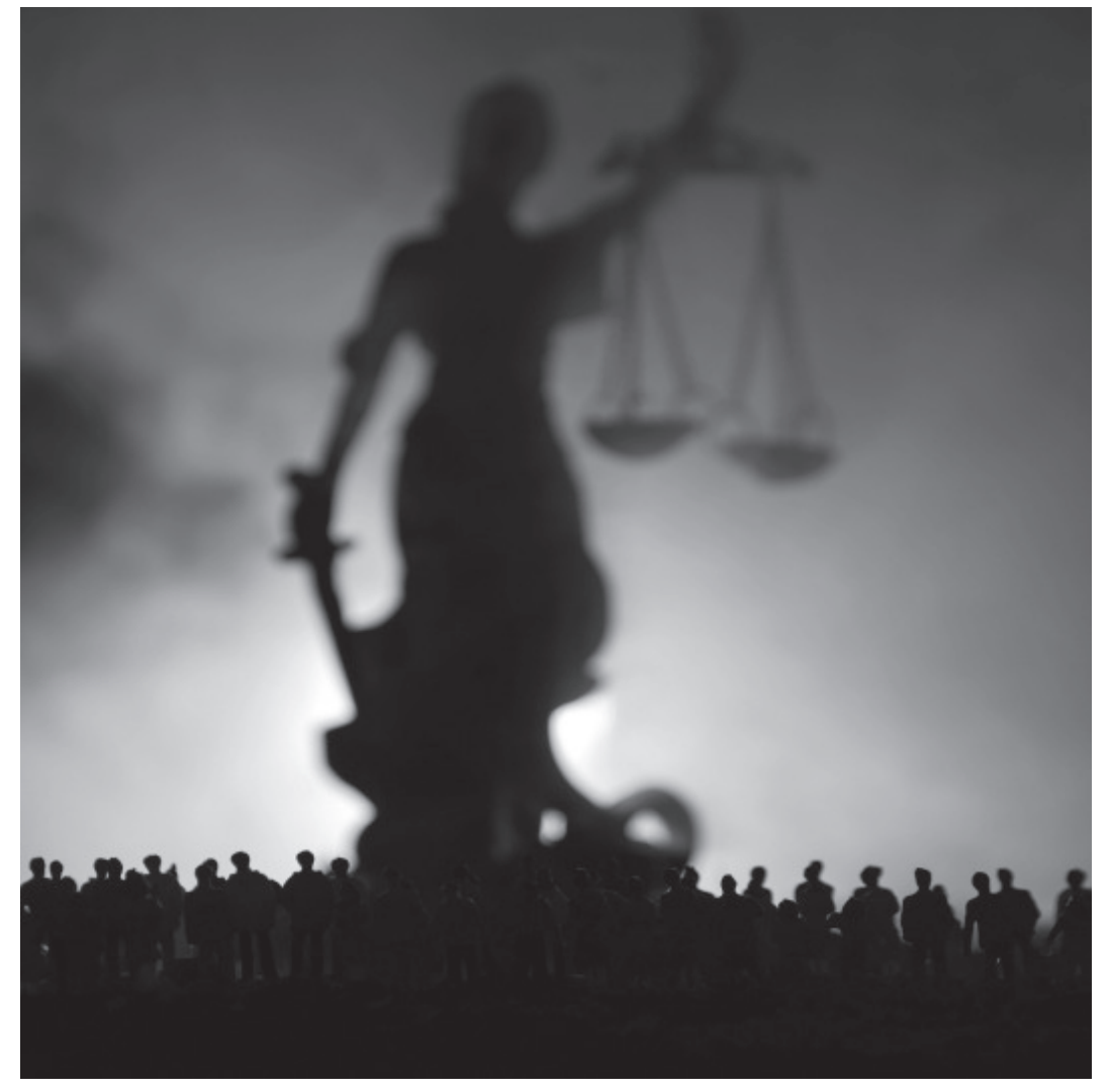
പുതുതായി ആരംഭിക്കേണ്ട സംവിധാനങ്ങൾ